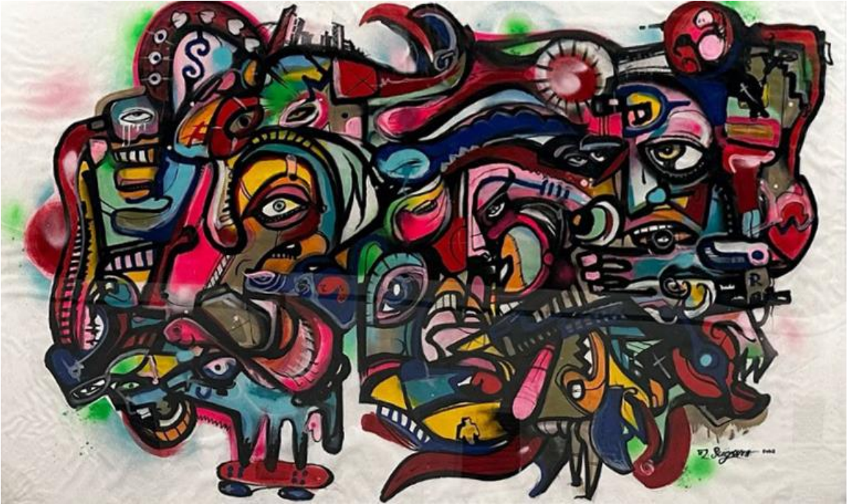
"This Place for Displaced," Rickie 'Sugars'; acrylic paint, ink, and spray paint; Downtown Eastside, Vancouver; 2024.

10:00 a.m. Sunday, September 29, 2024 Reconciliation Sunday