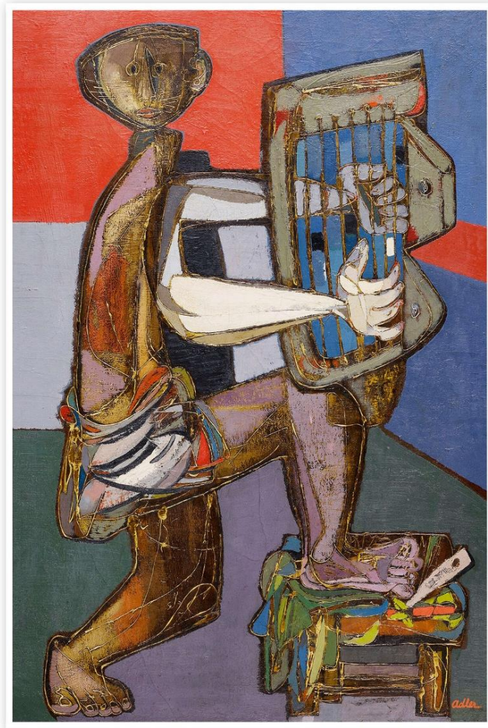
"King David," Jankel Adler, oil on canvas, ca. 1945.

10:00 a.m. Sunday, August 4, 2024 Eleventh Sunday after Pentecost